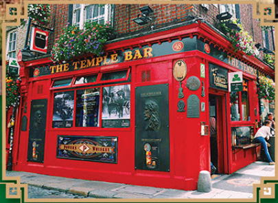
The Temple Bar, quite possibly one of the most iconic bars in all of Dublin, the history of the bar dates back to the early 1300s.