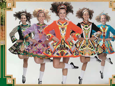
Irish dancing is performed traditionally with intricate foot work and is most known for the dancers performing with a stiff upper body so that the footwork is accentuated.