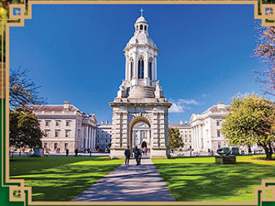
Enjoy a tour of the city, visit Trinity College and the Book of Kells, one of Ireland's greatest cultural treasures.