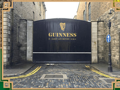
The Guinness Storehouse tour takes you through seven floors of Irish brewing history, where you will learn how the beloved stout beer is meticulously crafted to perfection.